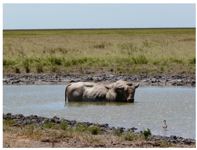
Ross Bambry, Brunchilly Station