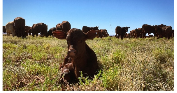
Gracie Morton, Innamincka Station