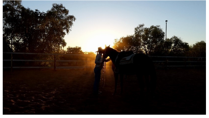
Rachel West, Glengyle Station