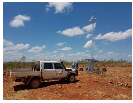
Digital UHF - Hughes Repeater, Ruby Plains Station

The Digital UHF system has been installed at Ruby Plains, Helen Springs, Brunchilly and Macumba. The remaining installations are on track for completion by the end of the financial year. The objective of 95% coverage over properties has been met, providing a mantle of safety for Kidman workers, and a better tool for station management.