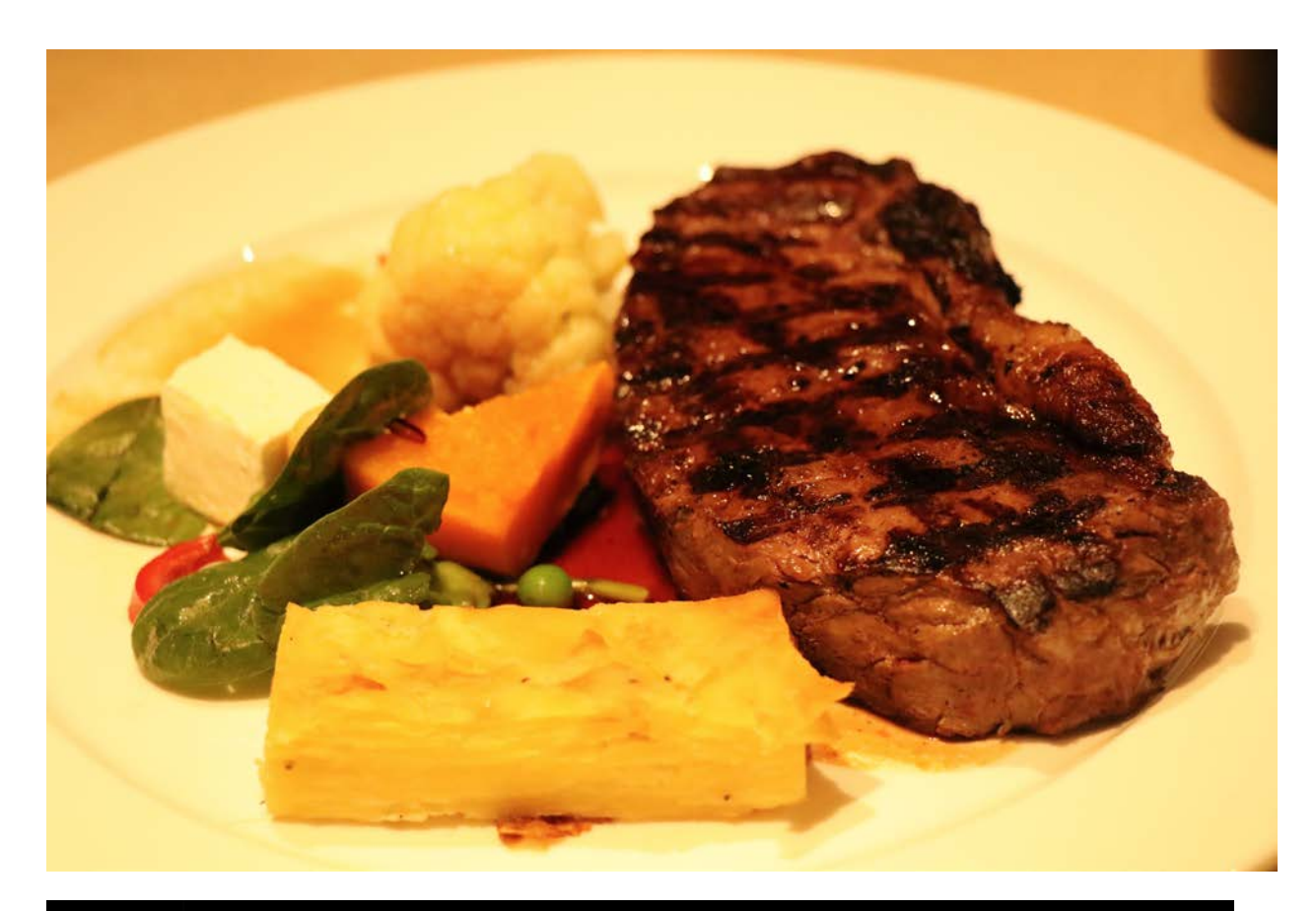
HANCOCK PROSPECTING PTY LTD